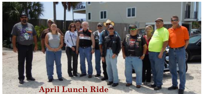
April Lunch Ride