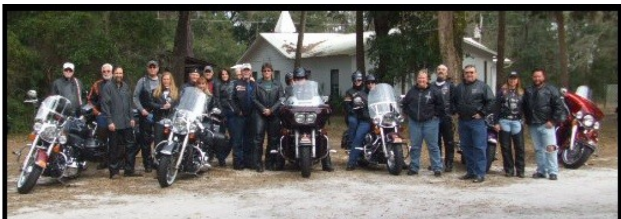
2/21/2010 Sunday Lunch Ride to Spring Creek 2/21/2010 Sunday Lunch Ride to Spring Creek