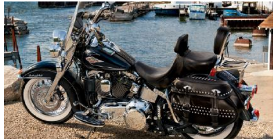
2011 Heritage Softail Classic

This is one of our most popular meetings of the year, for this is the meeting where we will see the new 2011 models! There will be new bikes on hand at the meeting, and CCHD staff will be going over all of the new features for 2011 Harley-Davidsons. So this is one meeting that you won't want to miss, especially if you have been thinking about upgrading your ride.